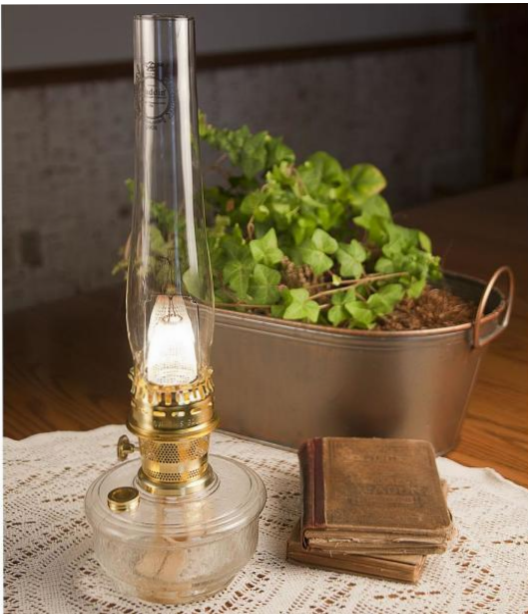
Aladdin Genie III